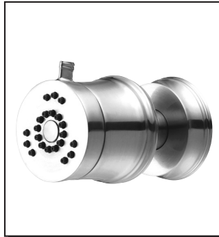
D460245 SOUTH SEA™