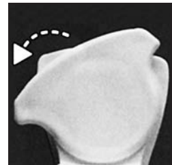
TWIST HINGE TO UNLOCK