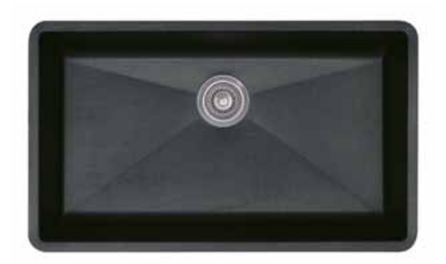
Model 440149 shown