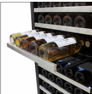
Shelves with Wooden Lip