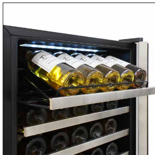
Top Removable Shelf