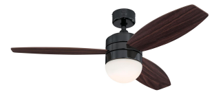
Reversible Walnut Finish Blades