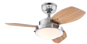
Reversible Beech Finish Blades