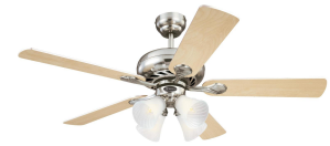
Reversible Light Maple Finish Blades