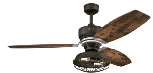
Reversible Reclaimed Hickory Finish Blades