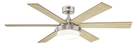
Reversible Light Maple Finish Blades