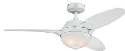
Reversible White Finish Blades