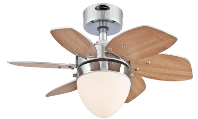
Reversible Beech Finish Blades