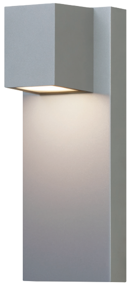
QUADRATE shown in silver