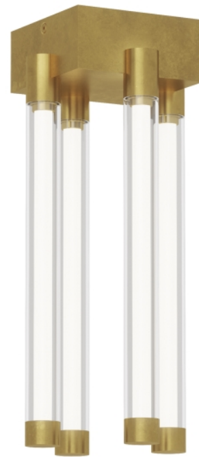
Natural Brass (Lit)