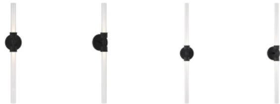
Nightshade Black Nightshade Black 3/4 Nightshade Black Alternate Version Nightshade Black Alternate Version 3/4

Includes 120 volt 17.4 watts, 1145 delivered lumens, 3000K LED module. Dimmable with most LED compatible ELV and TRIAC dimmers. 277V compatible with 0-10V dimmers. Mounts horizontally or vertically. ADA compliant. Ships with (1) 7.5IN and (2) 13.5IN additional pieces of glass for customization.