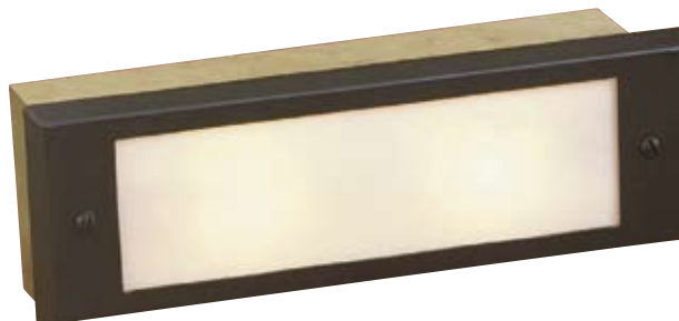
16 Window Natural Antique Bronze (NAZ)