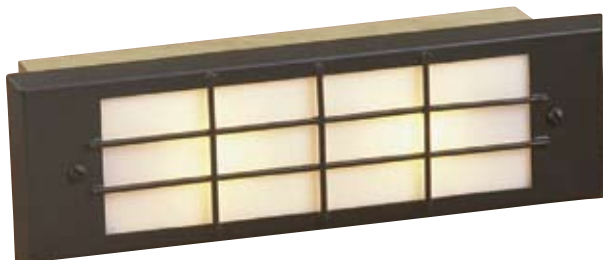
17 Grille Natural Antique Bronze (NAZ)