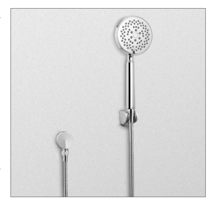
TS400F55: Transitional Collection Series B Multi-Spray Handshower 4-1/2"

The multi-spray handshower shall have a maximum flow rate of 2.5 gpm (9.5 lpm). Product shall have a 4-1/2" handshower and a 4" diameter spray face. Product shall have 5 multifunction spray modes. Spray modes shall be spray, spray and massage combo, massage, mist and pause. Product shall have rubber nozzles to prevent limescale build up. Product shall be TOTO Model TS400F55#____.