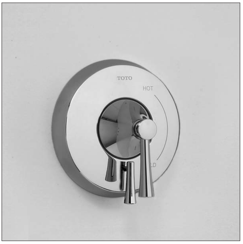
TS794PV - Nexus® Pressure Balance Valve Trim with Diverter