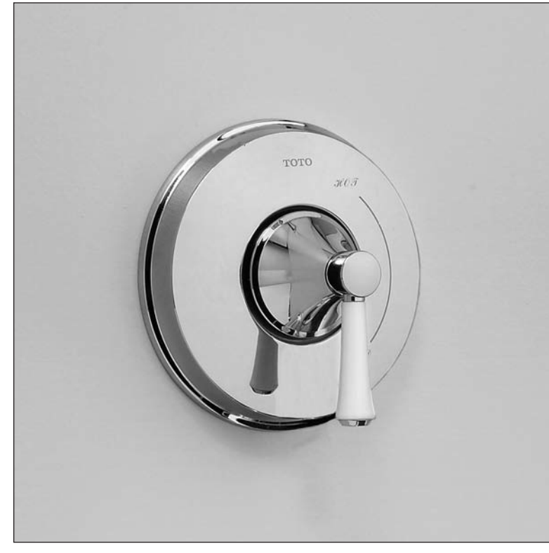
TS784P - Clayton® Pressure Balance Valve Trim without Diverter