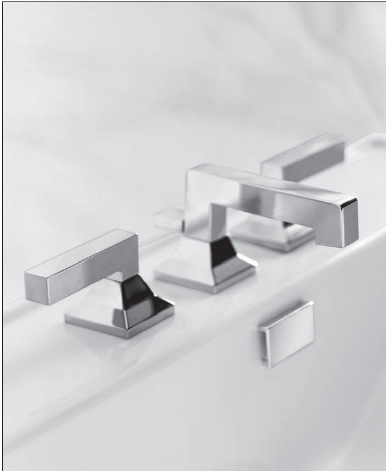
TL930DD#CP - Lloyd™ Widespread Lavatory Faucet