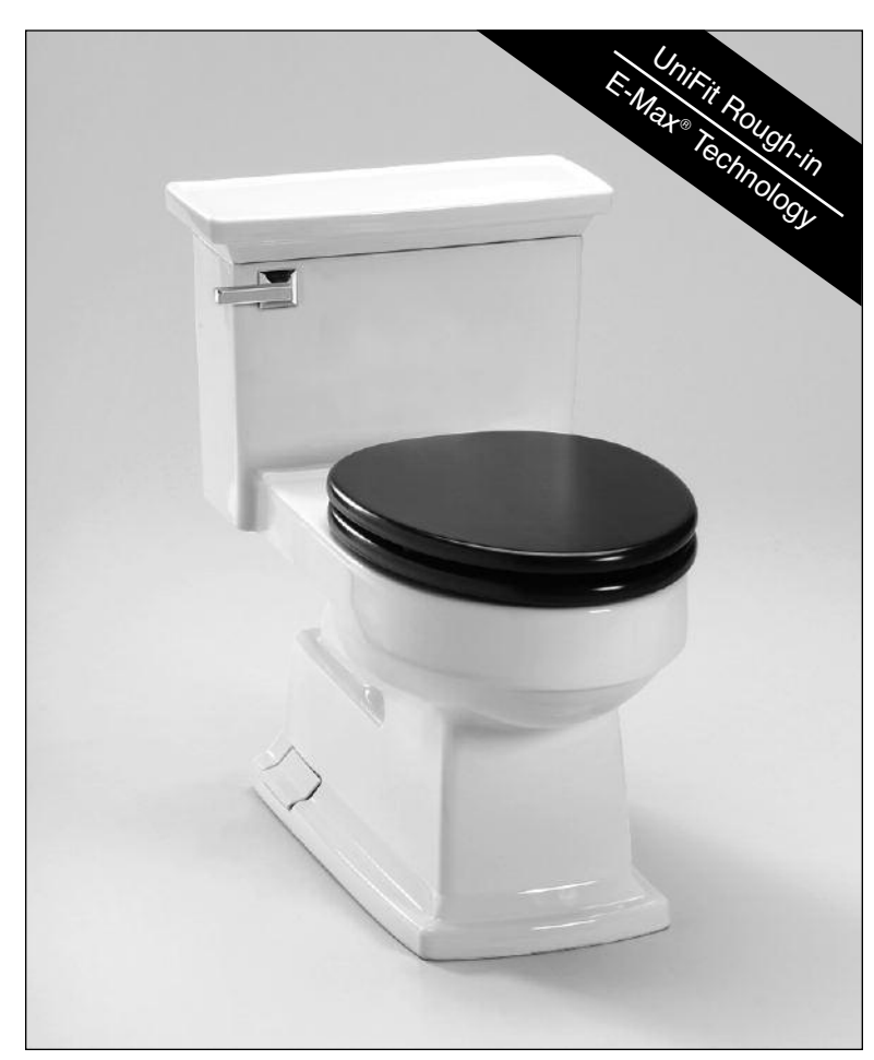
MS934304EF - Eco Lloyd® Toilet