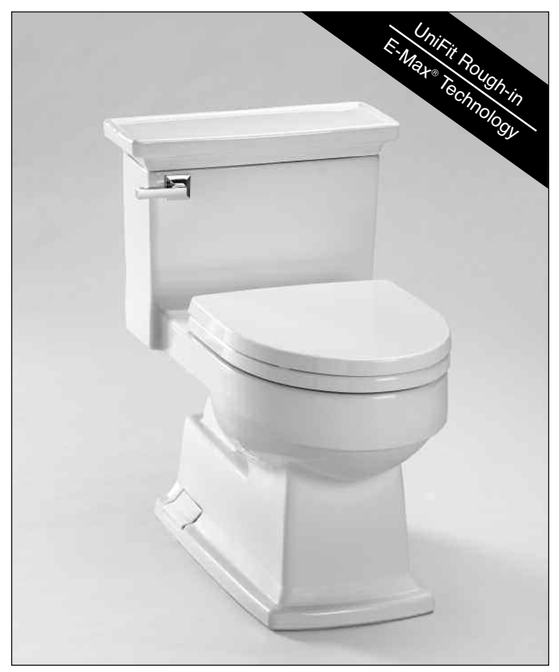
MS934214EF - Eco Lloyd® Toilet