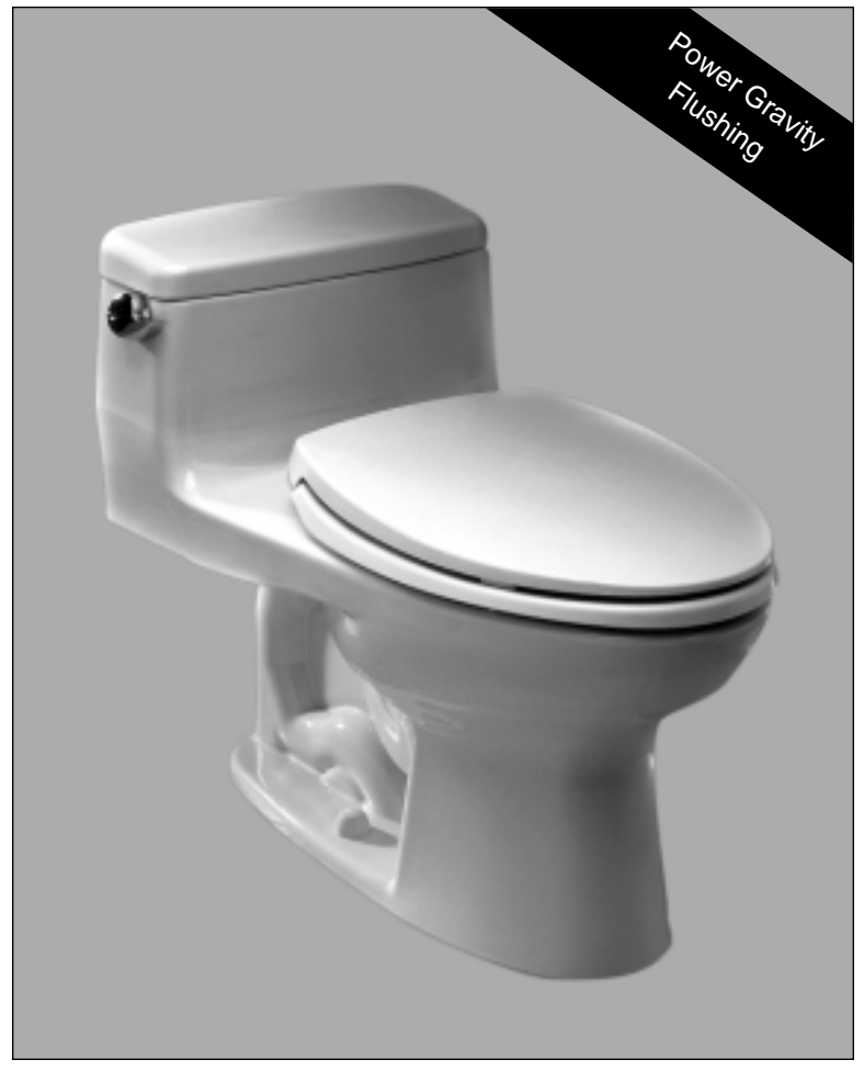
MS864114 - Supreme Toilet with SoftClose Seat