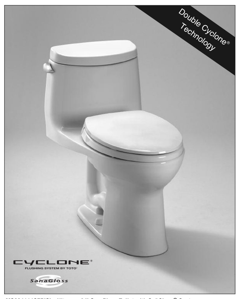
MS604114CEF(G) - Ultramax® II One-Piece Toilet with SoftClose® Seat