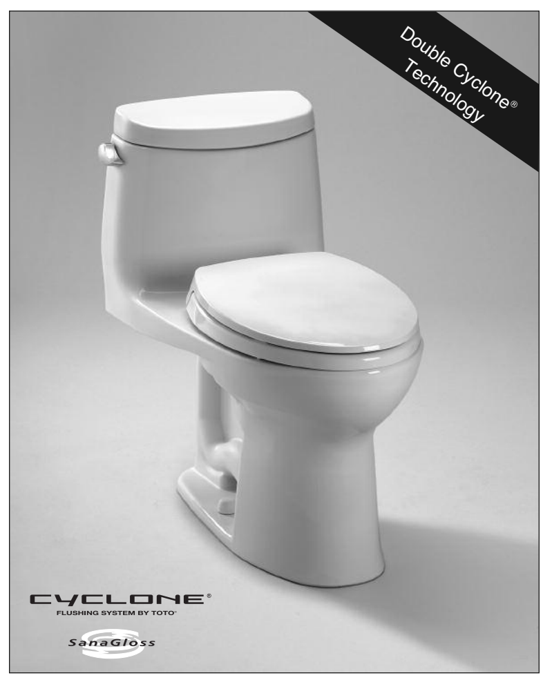
MS604114CEFG - Gwyneth™ One-Piece Toilet with SoftClose® Seat