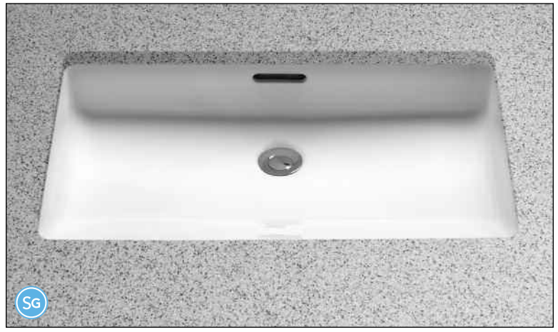
LT191(G) - Rectangle Undercounter Lavatory