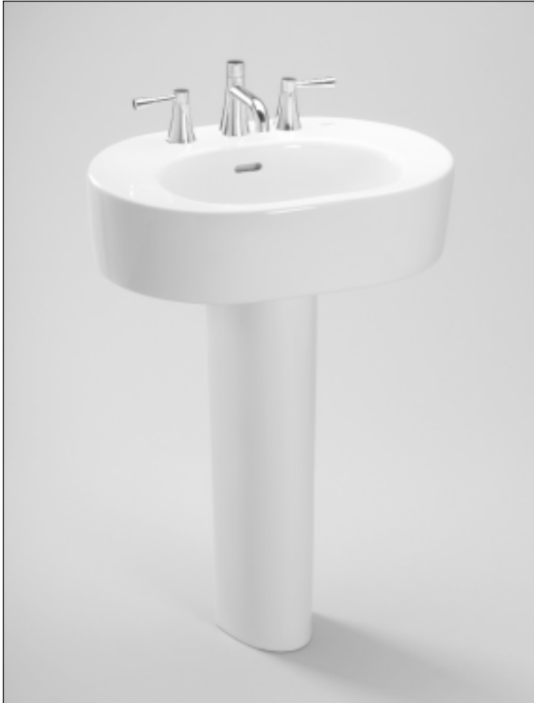
LPT790.8 - Nexus™ Pedestal Lavatory