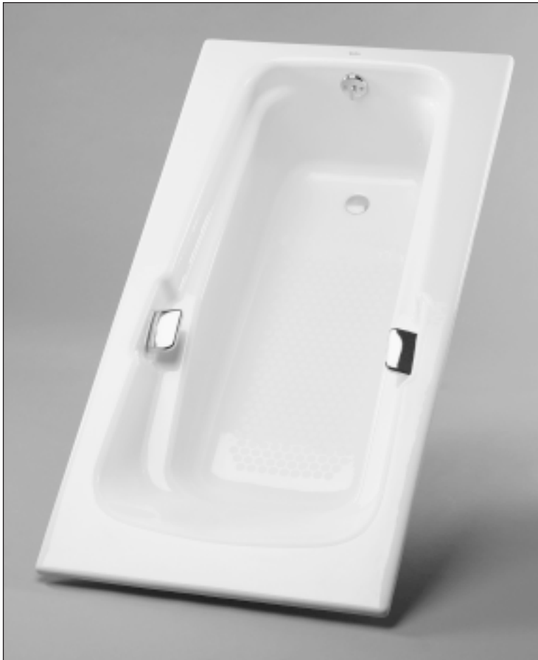
FBY1500P - Cast Iron Bathtub