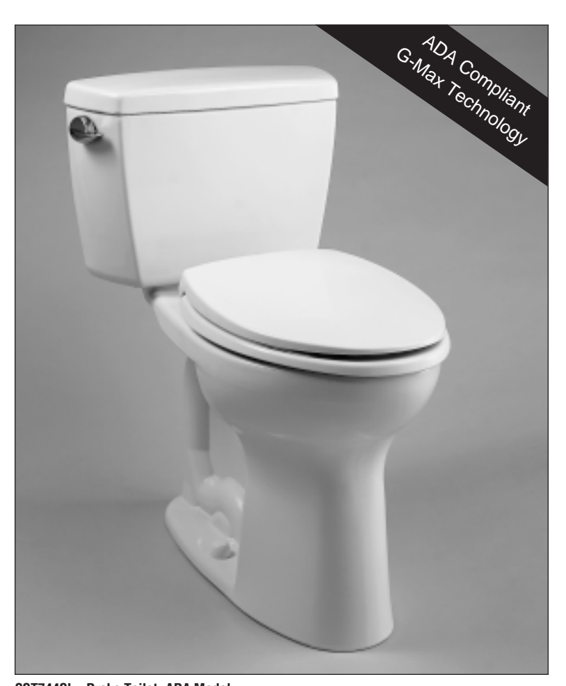
CST744SL - Drake Toilet, ADA Model SS114 - SoftClose Seat