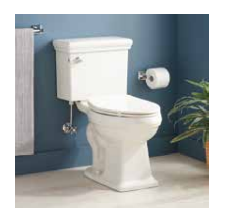
PAGE 2 CODE: SHKW240WH/SHKW200WH