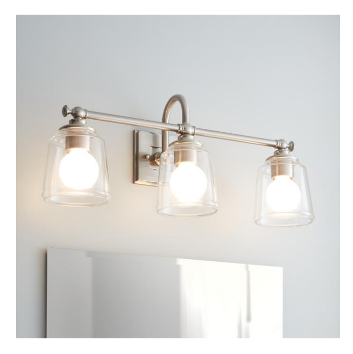
CODES/STANDARDS UL 1598 / CSA C22.2 No 250.0