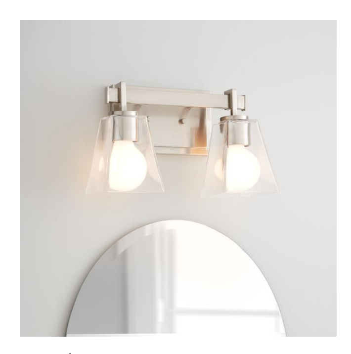
CODES/STANDARDS UL 1598 / CSA C22.2 No 250.0