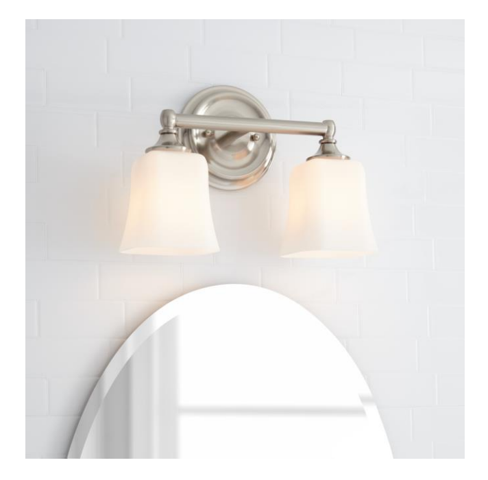
CODES/STANDARDS UL 1598 / CSA C22.2 No 250.0