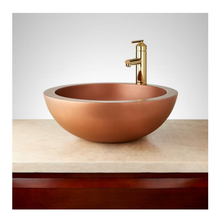
CSA B45.12/IAPMO Z402 Massachusetts Accepted