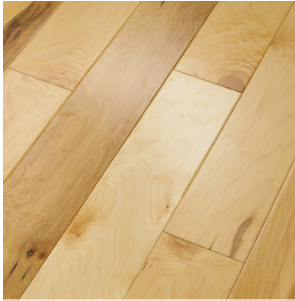
130 Maple Natural