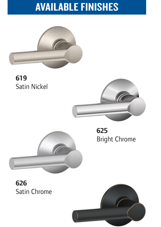
716 Aged Bronze

** Greenwich will be available to order Summer 2013