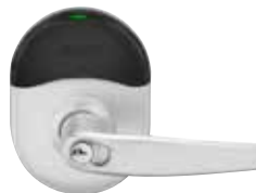
626AM - Satin chrome with antimicrobial