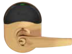
612 - Satin bronze