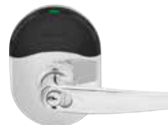
625 - Bright chrome