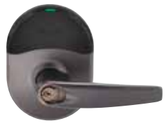
643e - Aged bronze