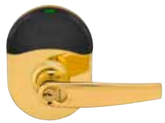
605 - Bright brass