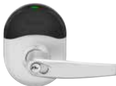
626 - Satin chrome