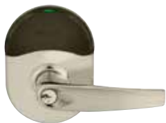
619 - Satin nickel