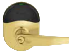
606 - Satin brass