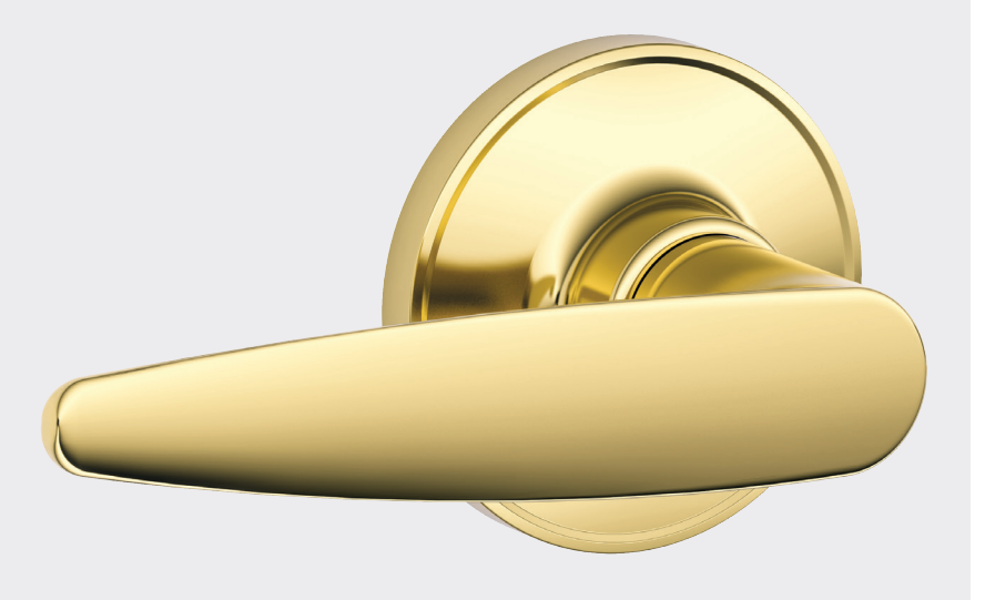
Bright Brass Lever