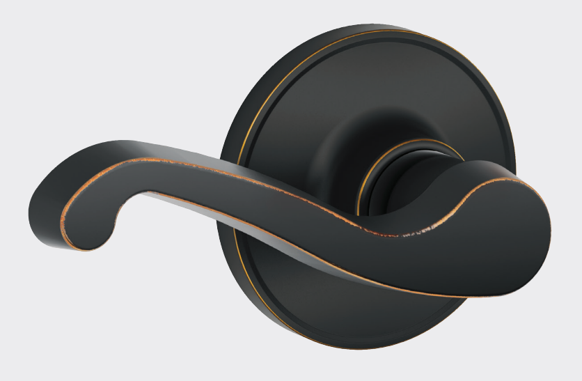
Aged Bronze Lever