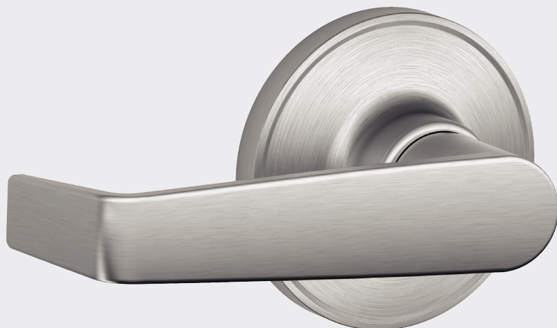
Stainless Steel Lever