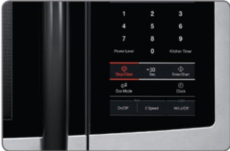
Digital touch control lets you easily program the desired cooking time and power.