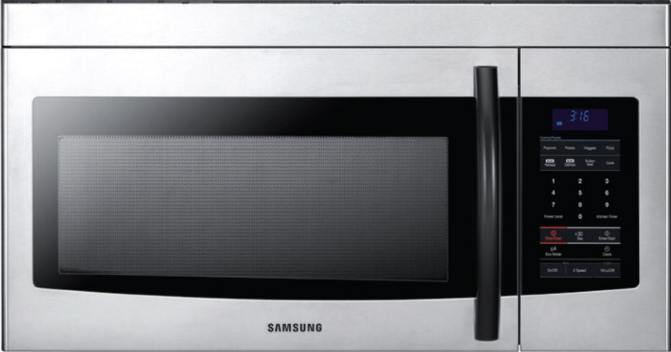
Stylish design compliments any kitchen decor and provides the high performance you expect only from Samsung.