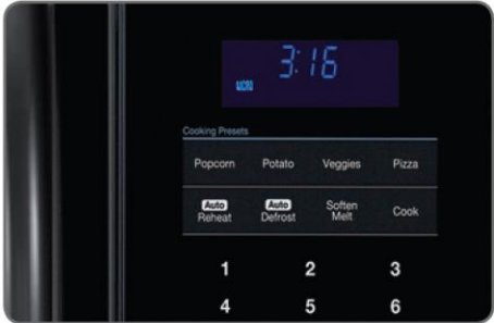
Features a blue digital LED Display – compliments any kitchen decor.