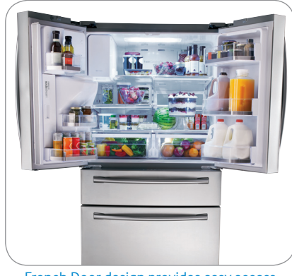
French Door design provides easy access to fresh food and flexible storage options.