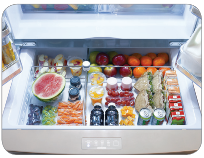
FlexZone Drawer with Temperature Control and SmartDivider.