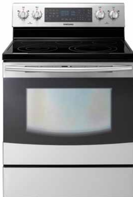
Easy to use cook top and oven with a 1.4 cu. ft. Storage Drawer.