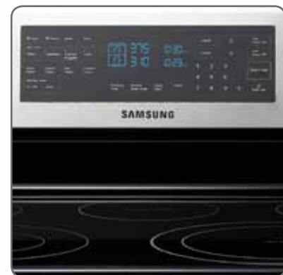
Controls at your fingertips with an easy to read LED display.