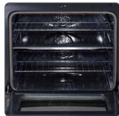
Generous 5.9 cu. ft. cavity has more flexibility with a divider.