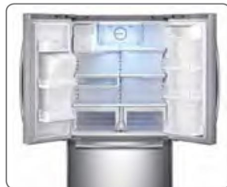
French Door design provides easy access to fresh food and flexible storage options.