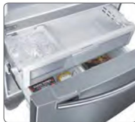
Filtered Dual Ice in Freezer.