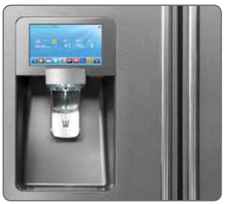
8" LCD Digital Display with Apps.