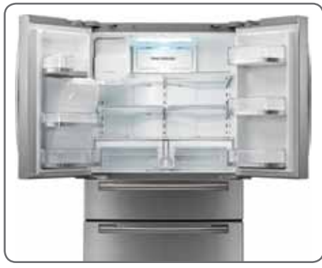
The innovative 4-door refrigerator is perfect for large families and those that love to cook and entertain.