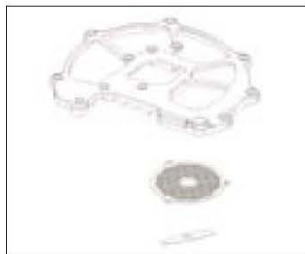
2-Stage Filtration: Eliminates the need for pre-rinsing.