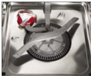
Samsung's Storm Wash has a powerful built-in nozzle, a tilted racking system and ample height for the messiest pots.