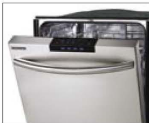
Dishwasher Sound Insulation: Samsung provides one of the quietest dishwashers in its class.