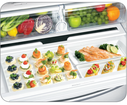
CoolSelect Pantry<sup>™</sup> with Temperature Control