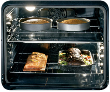
Flex Duo™ Oven

Fingerprint Resistant Black Stainless Steel