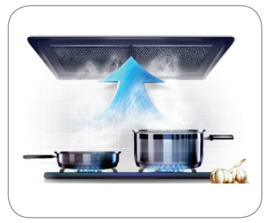
300 CFM Ventilation System