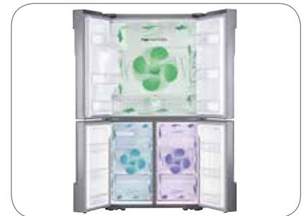
Triple Cooling System