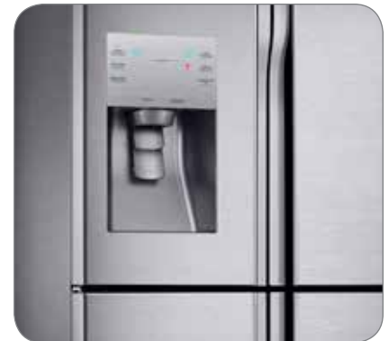
Clean, Modern Design