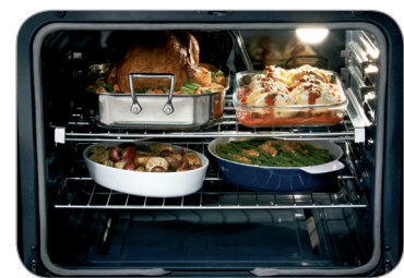
Large 5.8 cu. ft. Capacity