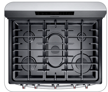
Five Burner Cooktop